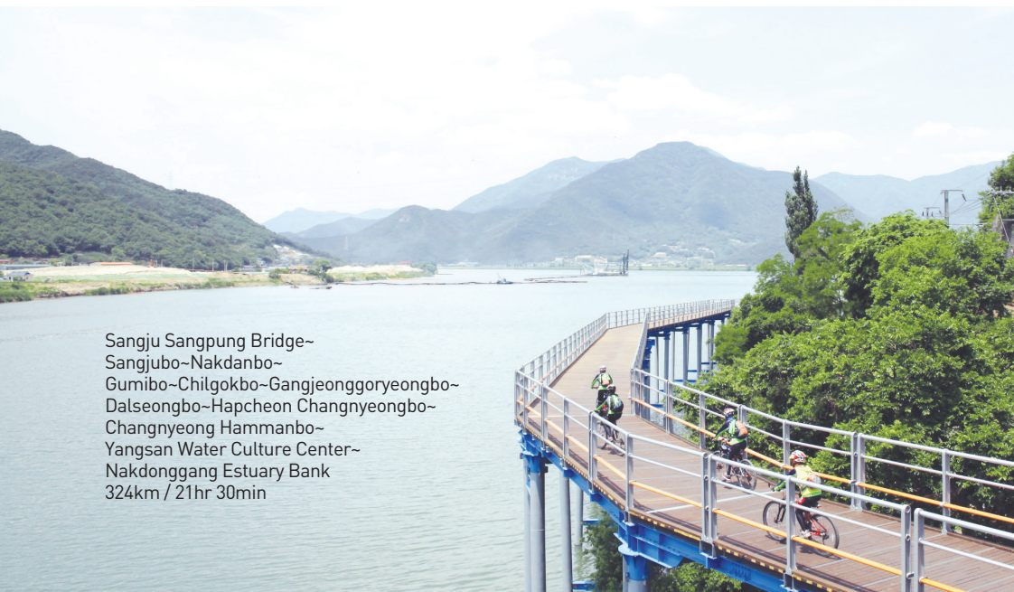
Sangju Sangpung Bridge~ Sangjubo~Nakdanbo~ Gumibo~Chilgokbo~Gangjeonggoryeongbo~ Dalseongbo~Hapcheon Changnyeongbo~ Changnyeong Hammanbo~ Yangsang Water Culture Center~ Nakdonggang Estuary Bank 324km / 21hr 30min

The civilization of the mankind originated from the river. Accordingly, Nakdonggang bicycle path that runs by the river has many historic sites to visit. 324km of this bicycle path of the cultural heritage from Sangju Sangpung Bridge to Nakdonggang Estuary Bank in Busan brings down the curtain on the cycling tour across the country with welcoming seagulls of Busan.