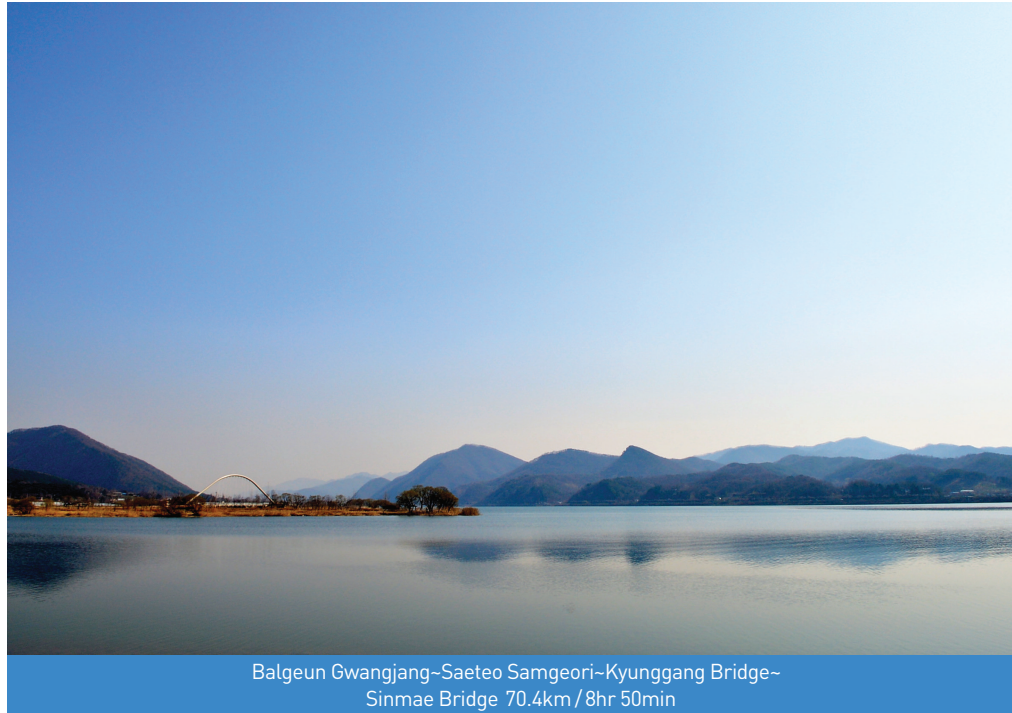
Balgeun Gwangjang~Saeteo Samgeori~Kyunggang Bridge~ Sinmae Bridge 70.4km / 8hr 50min

The 70.4km long Buekhangang(riv.) Bicycle Path links Seoul and Chuncheon in Gangwon Province. Passing through the Uiamho-lake, Ungil-mountain, and Chukryeong-mountain areas, you can enjoy this beautiful scenic bicycle path.