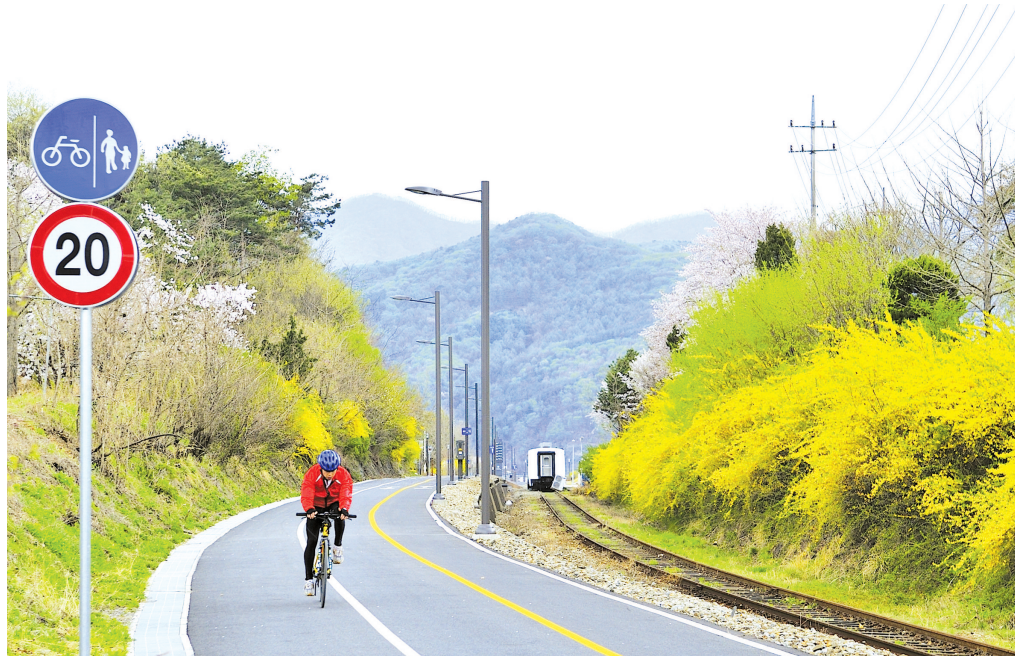
Paldang Bridge~Neungnae Station~Bukhangang Railroad Bridge~Yangpyeong Art Museum~Ipobo~Yeoju~Gangcheonbo~Suhaeng Bridge~Chungju Tangeumdae 132km / 8hr 50min

Starting at Paldang Bridge, Namhangang(riv.) bicycle path cuts through the picturesque villages of Namyangju, Yangpyeong, Yeosu, Wonju, Chungju and finishes its 132km of journey at Chungju Tangeumdae.