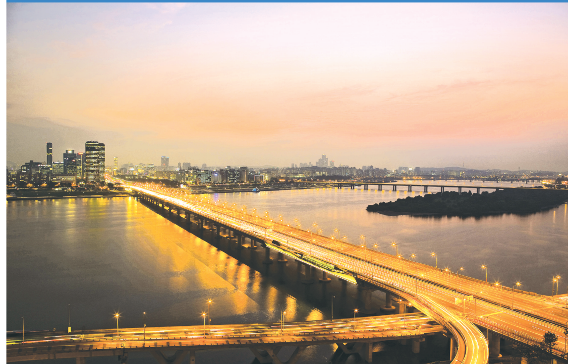
ARAHANGANG Lock Gate~The Southern End of Yeouido Seongangdaegyo(Bridge)~ [Ttukseom Observation Complex or Gwangnaru Bicycle Park]~Paldangdaegyo(bridge) 56km / 3hr 40min

Skyscrapers and bridges of Han River pass by as pedals are worked, and ferries and yachts of gorgeous colors on the river will not let riders' eyes off of them. Sceneries of the sunset and night views of Han River make the Thames of London or the Seine of the Paris colorless.