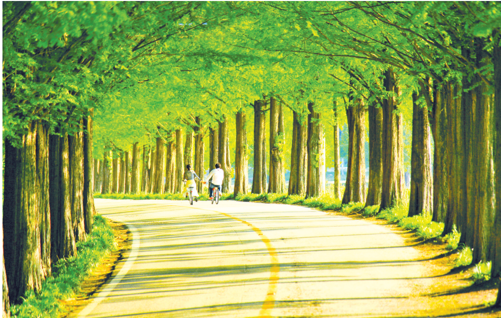
Damyangdam-Metasequoia-Damyang Bamboo Forest-Seungchonbo-Juksanbo-Neureoji Observatory-Yeongsangang Estuary Bank 133km / 8hr 50min

Yeongsangang(riv.) is the lifeline of the Southern Province risen from Yongso of Yongchu valley in Damyang County. Yeongsangang runs into the West Sea, joining the tributaries such as Hwangryonggang, Jiseokcheon, Gomagwoncheon on the way.