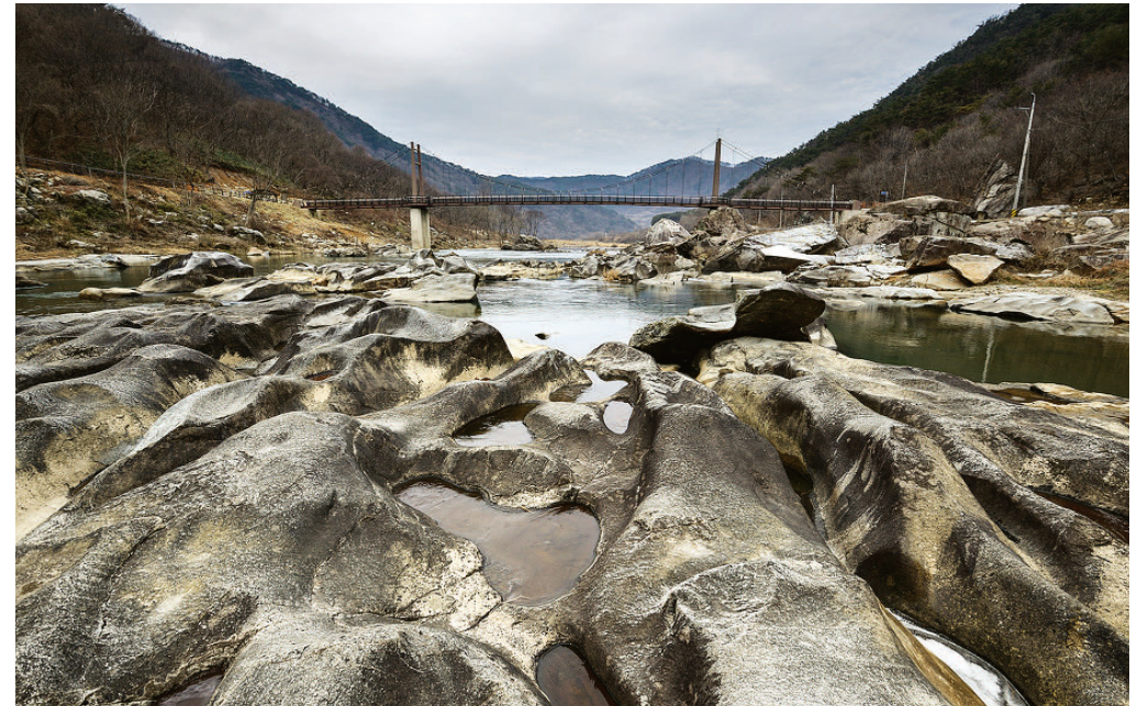
Seomjingangdam-Hyangga Park-Sasung Temple-Baealdo Waterfront Park 154km/10hr

Seomjingang(riv.) rises from Palgongsan(mt.) and flows for 212.3 kilometers before reaching its final destination in Gwangyang, where it enters Gwangyang Bay.