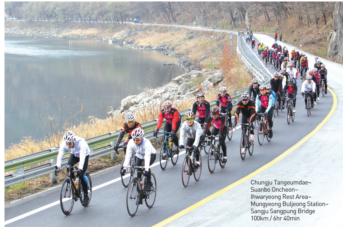
Chungju Tangeumdae~ Suanbo Oncheon~ Ihwaryeong Rest Area~ Mungyeong Buljeong Station~ Sangju Sangpung Bridge 100km / 6hr 40min

There are resting areas along the Saejae bicycle path every 1km for riders to recharge their energy with fresh air of the mountain breeze. Safety structure at the cliff section of the road is built with thinning-out tree, which used to be firewood, to protect the environment while promoting safety of the riders.