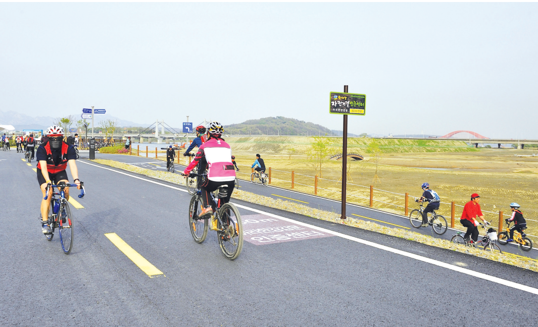
ARA West Sea lock gate~ARA HANGANG lock gate 21km / 1hr 30min

Cross-Country Cycling Road starts at Incheon West Sea lock gate informing 'the Great Voyage'. This 21km of ARA bicycle path, known as 'the fantastic cycling road' by the riders and Gyeong-In ARA waterway that brings West Sea and HANGANG(riv.) together, are located side by side.